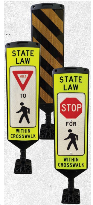
Images of different sign options on Shur-Tite Flexible Type III Object Markers from Shur-Tite’s product brochure.

Shur-Tite Flexible Type III Object Marker, by Shure-Tite Products, Inc., is a 12” x 36” flexible marker used for notifying or alerting traffic. This marker is ground mounted, uses its flexible design to rebound when impacted, and contains an inlaid face for custom displays. Shur-Tite Flexible Type III Object Marker is Manual on Uniform Traffic Control Device (MUTCD) compliant and is Approved on the APL as NP24-9491. For more information, please visit http://www.shur-tite.com .